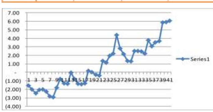
Open Market Operation-OMO Result